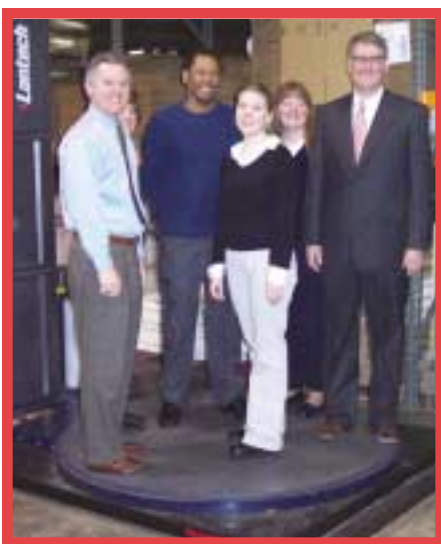
Pictured above: Lighten Up Webcrafters weigh-in day.