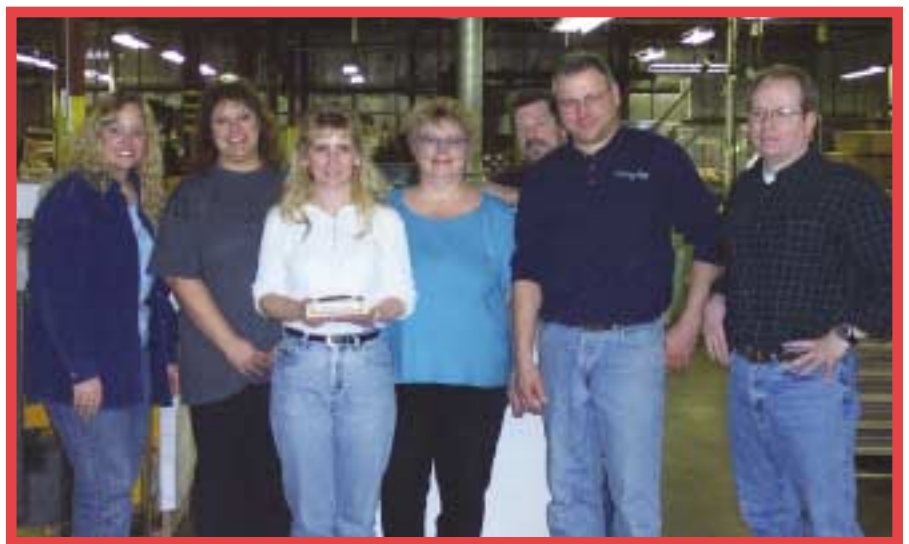
Pictured above: Team "Barbie and Friends" were the 1st winners of the Lighten Up Webcrafters traveling trophy. "Weigh" to go team!