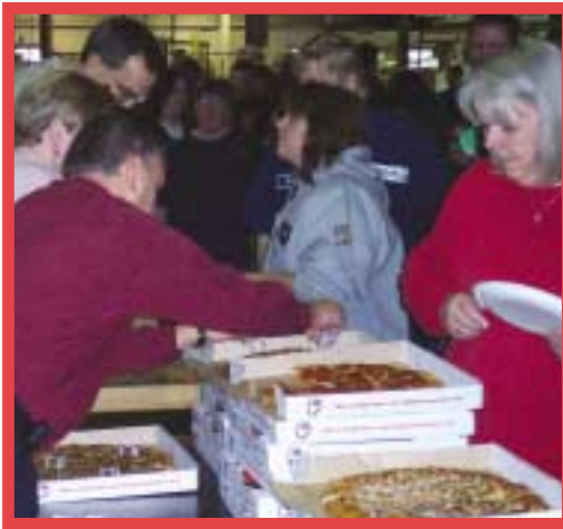
Pictured at left and right: The Bindery broke their previous record of consecutive days without a lost time injury. Pizza was served to celebrate.